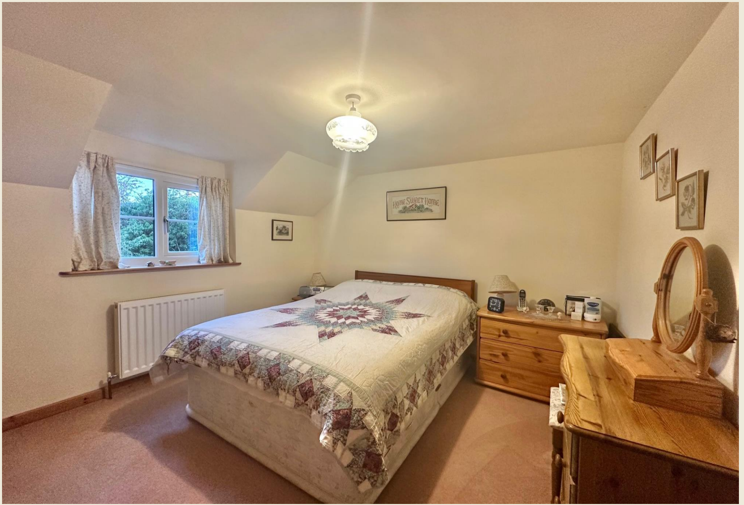
BEDROOM TWO 11'2 x 10'3