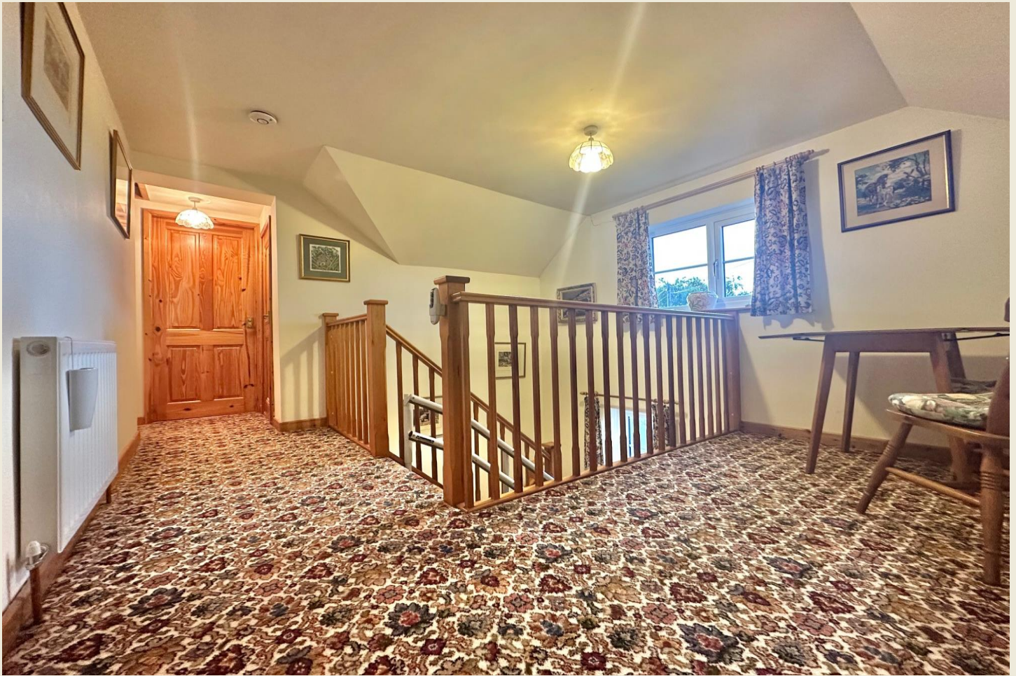
GALLERIED FIRST FLOOR LANDING WITH STUDY AREA 12'4 x 11'1