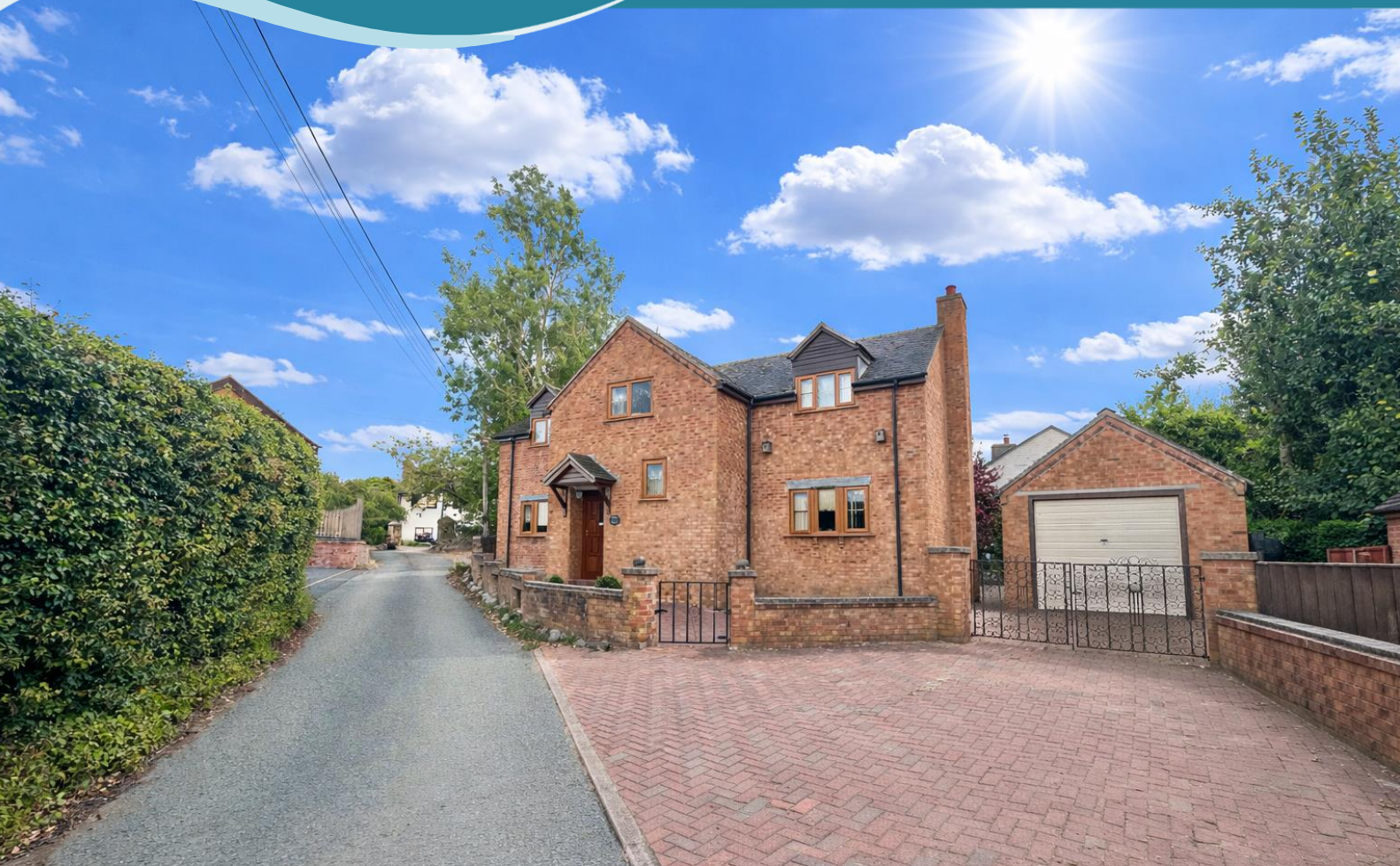
'CHURCH COTTAGE' | DAMSON LANE | COX BANK, AUDLEM | CHESHIRE | CW3 0EU | OFFERS OVER £395,000