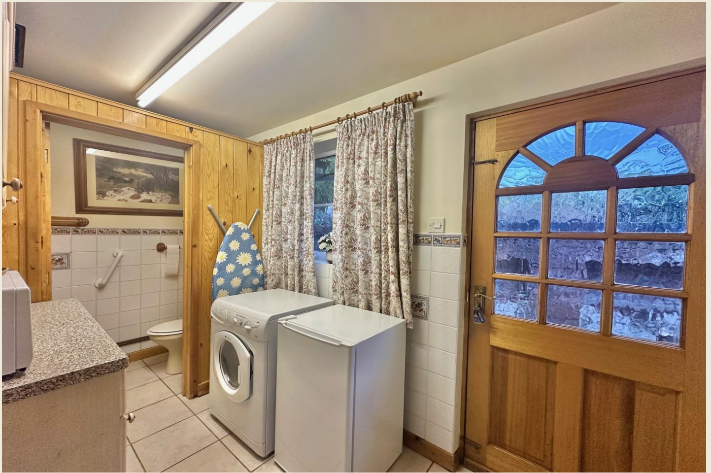
UTILITY ROOM 8'11 x 5'9