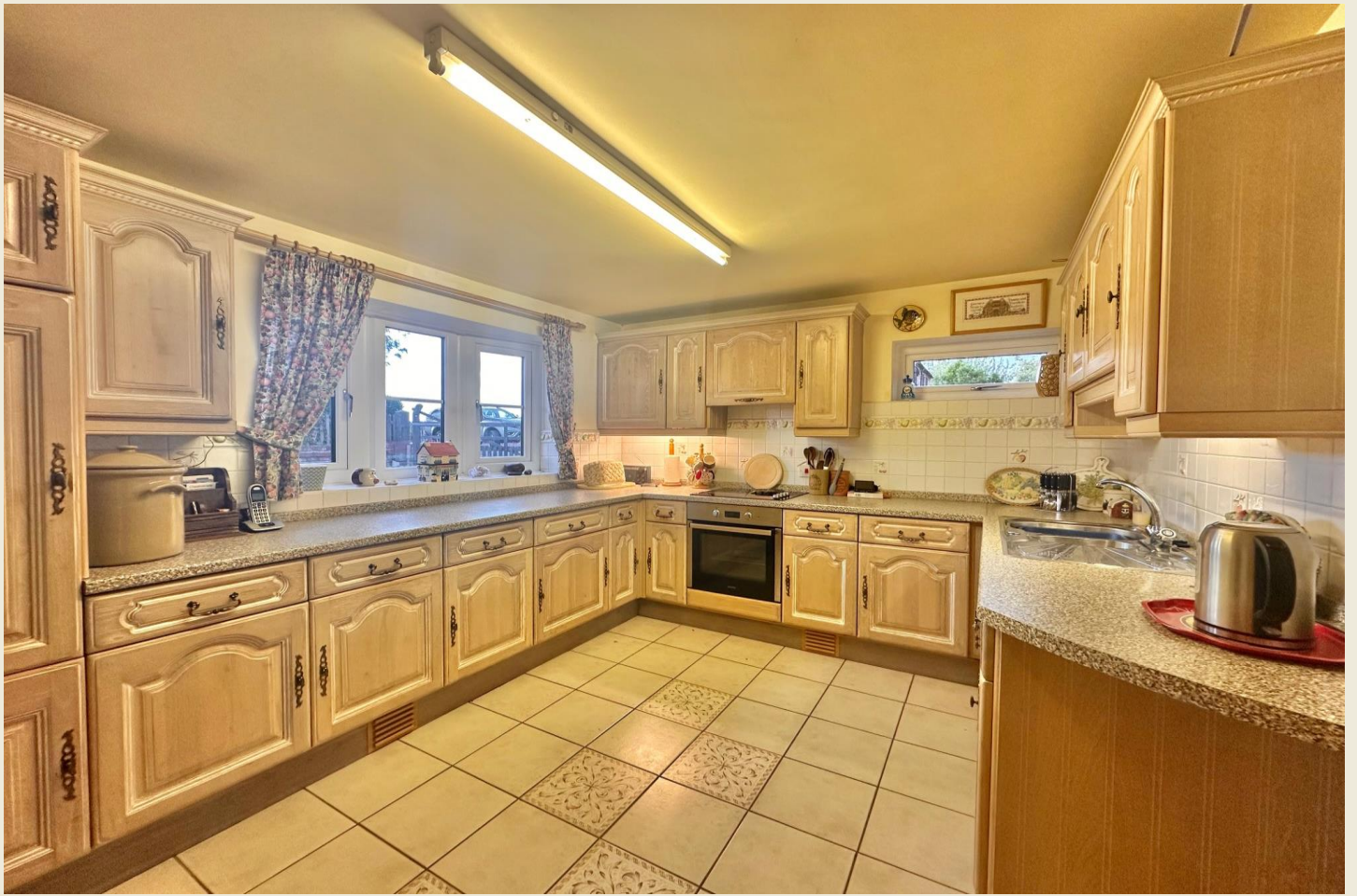
KITCHEN 12'2 x 10'2