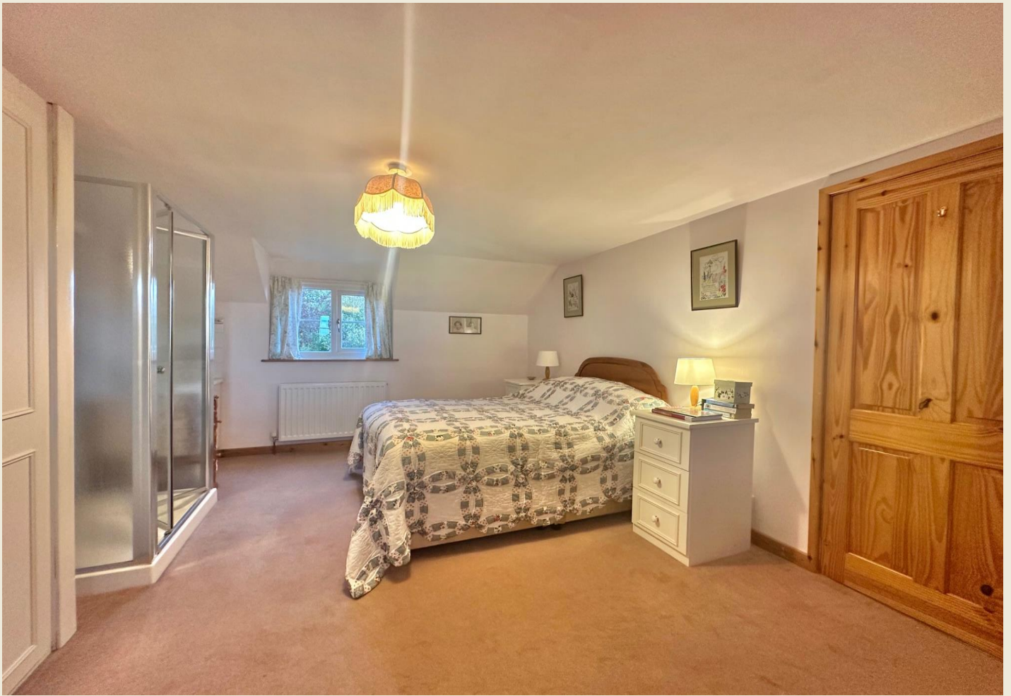
MASTER BEDROOM ONE 16'7 x 12'3